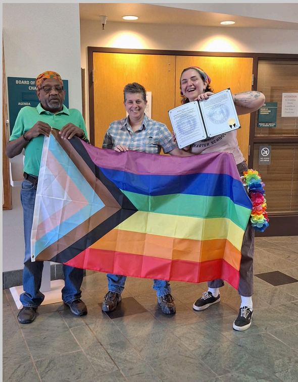
Above: Hopland Flag raising Below: The Bolt, Baskets and Bonnets