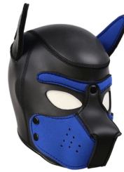
Education: Puppy Play