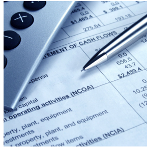
4th Quarter Financial Report