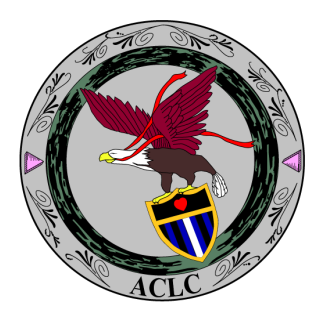
The Alameda County Leather Contest 2012