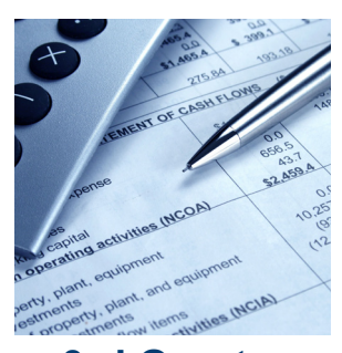
3rd Quarter Financial Report