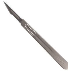
Education: Knife Play