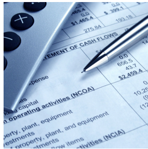
1st Quarter financial report