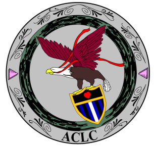
The Alameda County Leather Contest 1992