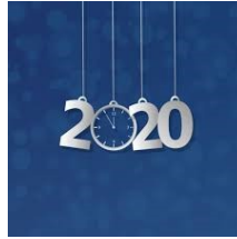
ACLC: By the Numbers