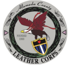
Catch the Patch: Out and about in our communities