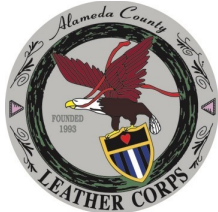
Catch the Patch: Out and about in our com- munities