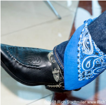
State of the Club: President's Report