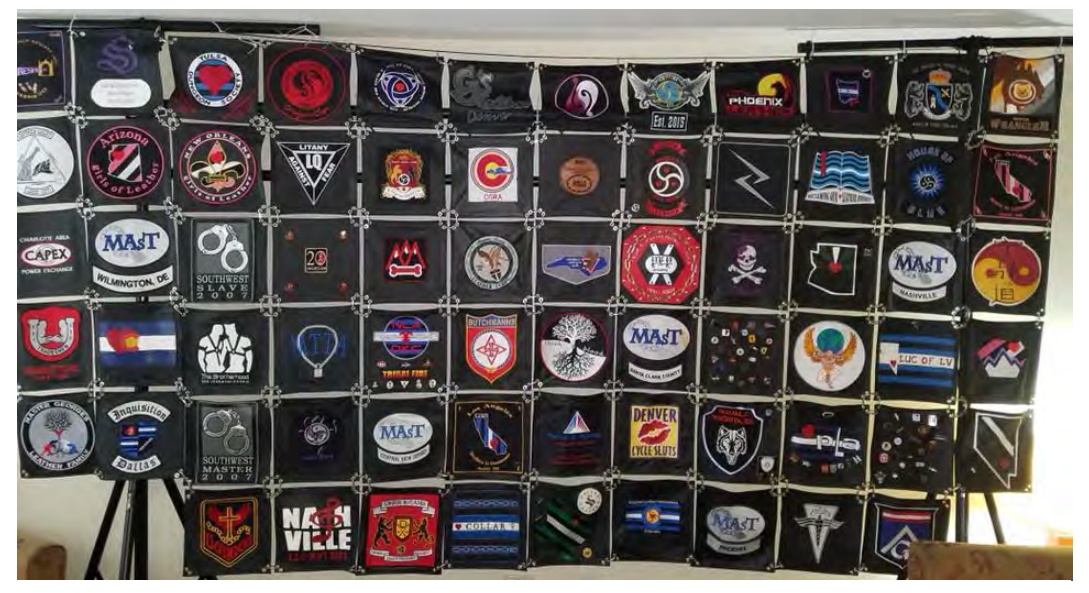
The Leather Quilt on display at the Tarheel Leather Run in Greensboro, NC over the weekend of July 6^{th} - 9^{th} , 2018. ACLC's patch can be found in column 6, row 3.